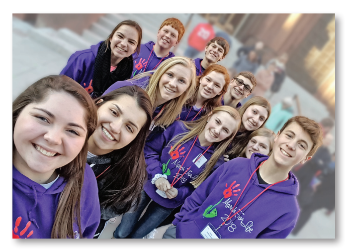
GACC students attended the 2018 March for Life in Washington, D.C.

On top of being at the March for Life, going to the Planned Parenthood building was extremely impact-